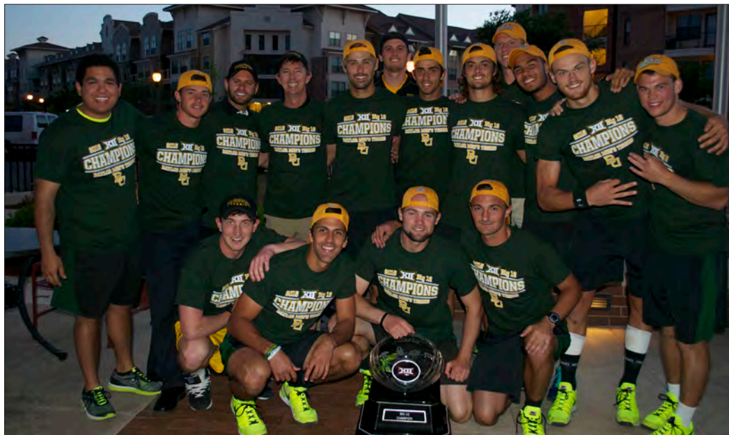
No. 2 Baylor men's tennis poses after capturing its 12th Big 12 Championship trophy in the past 14 seasons after a dominating 4-1 win against No. 16 Texas Tech in Lubbock.