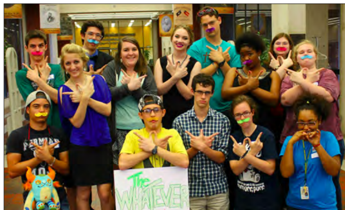
Members of The Whatever, an unchartered group on campus, display the group's hand symbol. The group is performing random acts of kindness this week in honor of its event, #ArkWeek2015.