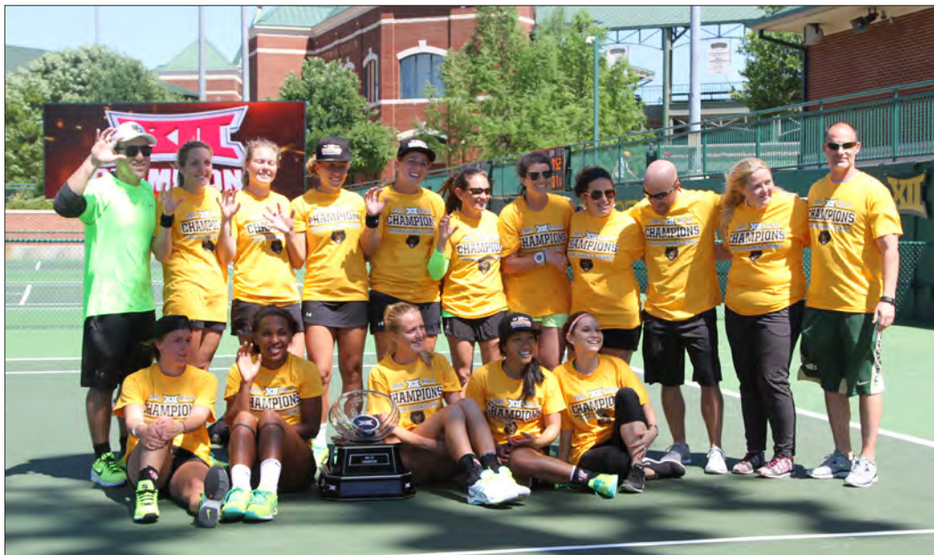
No. 8 Baylor women's tennis throws a Sic 'Em on the court after winning its ninth Big 12 Championship in the last 10 years at the Hurd Tennis Center on Sunday.