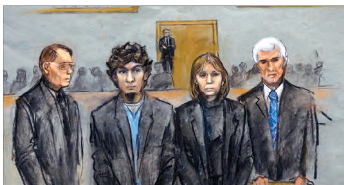
In this courtroom sketch, Dzhokhar Tsarnaev, second from left, is depicted standing as the jury presents its verdict in his federal death penalty trial on April 8 in Boston. Tsarnaev was convicted on multiple charges in the 2013 Boston Marathon bombing.