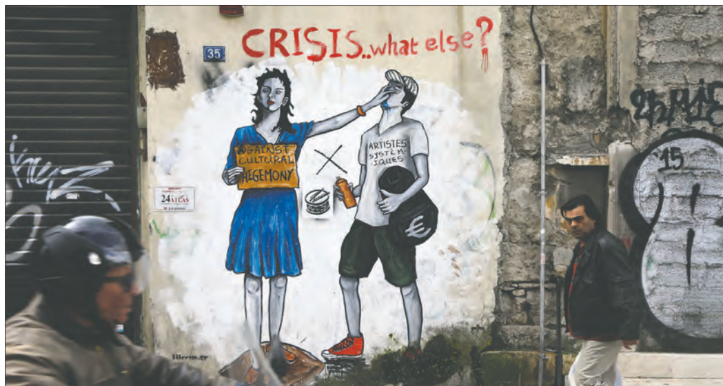
A pedestrian passes anti-austerity graffiti Monday in Athens. Greece's radical left government and its European creditors are heading into new talks on the country's bailout program, despite low expectations for a deal.