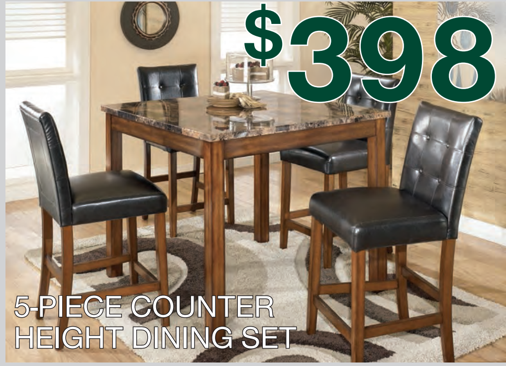
5-PIECE COUNTER HEIGHT DINING SET