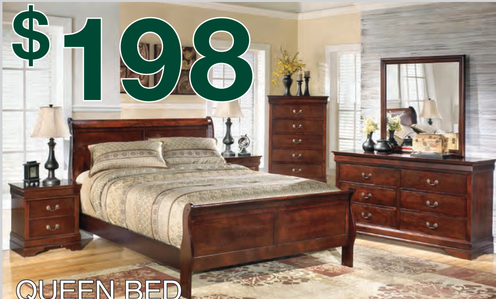
QUEEN BED Includes Queen Headboard, Footboard & Rails