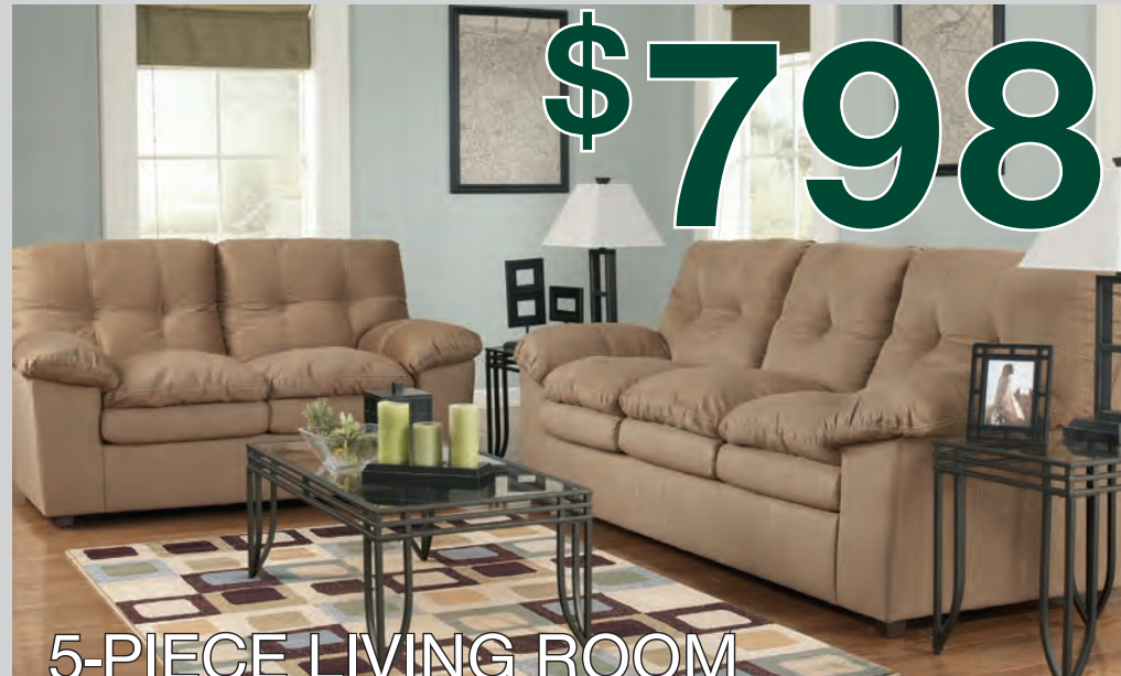
5-PIECE LIVING ROOM Includes Sofa, Loveseat, Cocktail Table & 2 End Tables