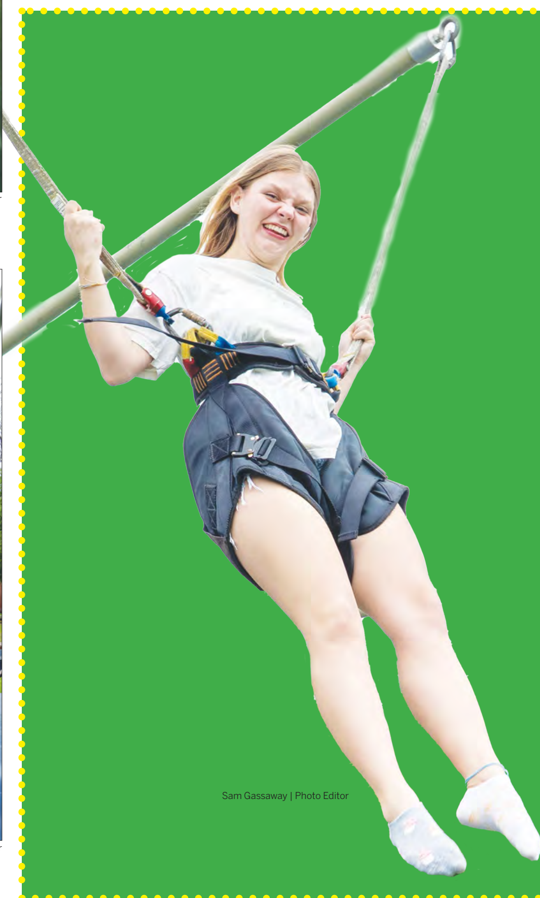
JUMPING AROUND From bungee jumping to rock climbing, Fountain Mall had no shortage of activities for students on Diadeloso.