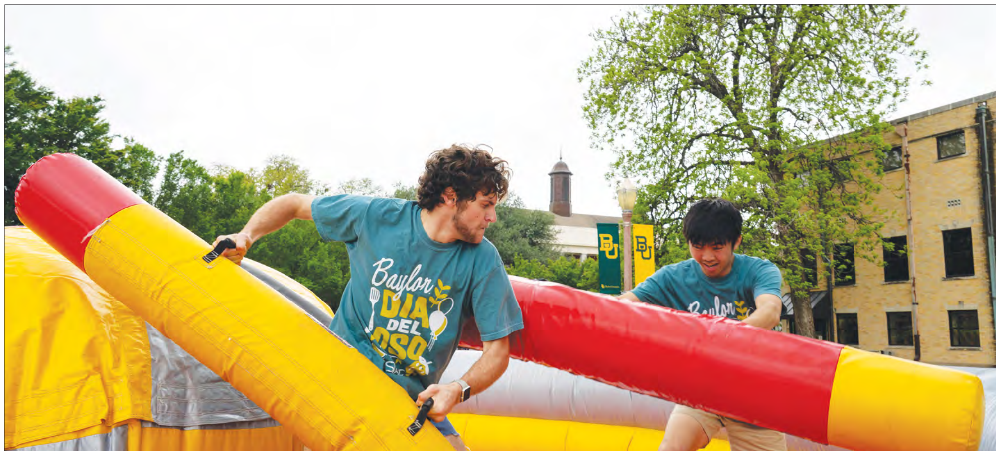
JOUST Two students take up the inflatable jousting attraction on Fountain Mall as Diadeloso ignites friendly competition, community fun and Baylor spirit.