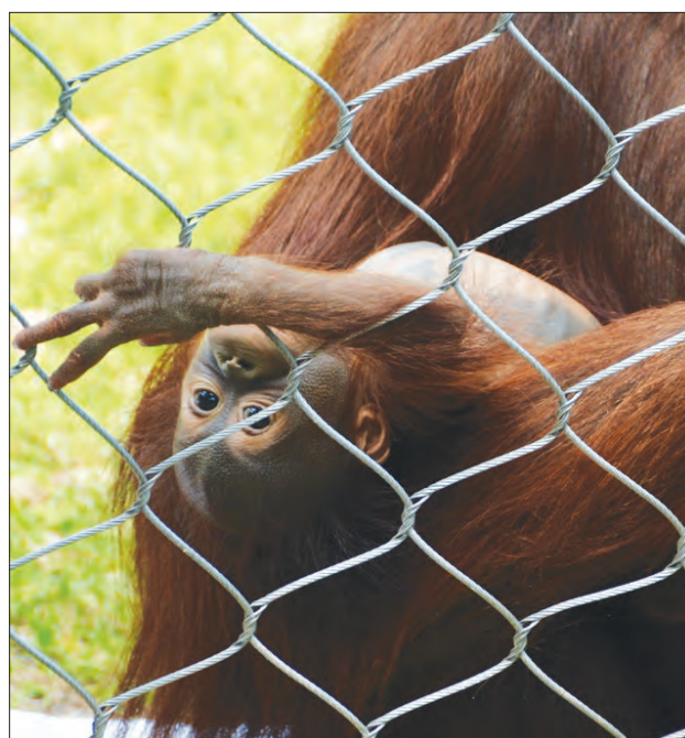
Kamryn Anthis | Intern

The clinic serves as a donation of knowledge to improve the livelihood of different species in zoos all over. Zoo employees encouraged Waco residents to visit the zoo to learn more about the primates and their training.