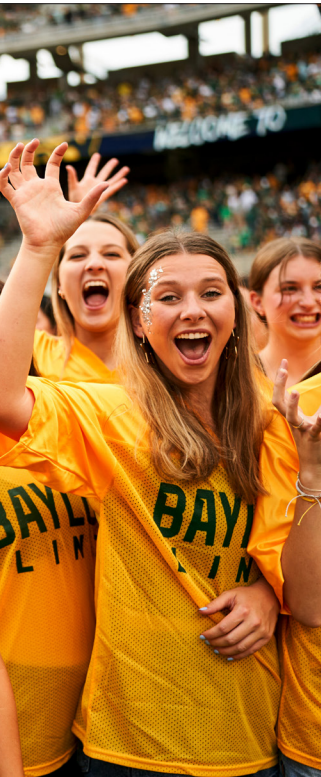
the football team's home opener