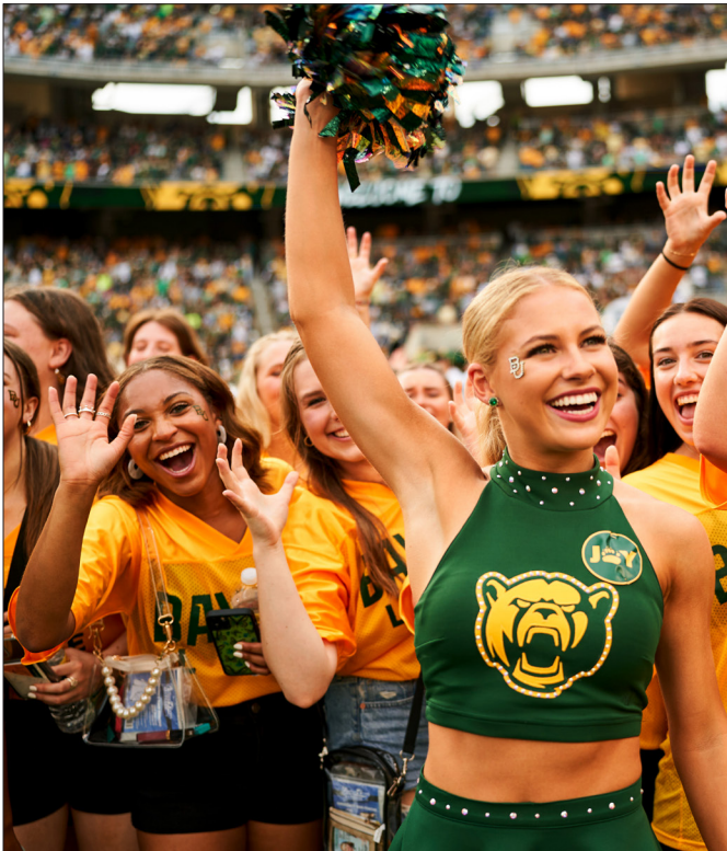
CHEERS A member of the Baylor Spirit Squad starts a chant during a game against the University at Albany on Sept. 3, 2022 at McLane Stadium.