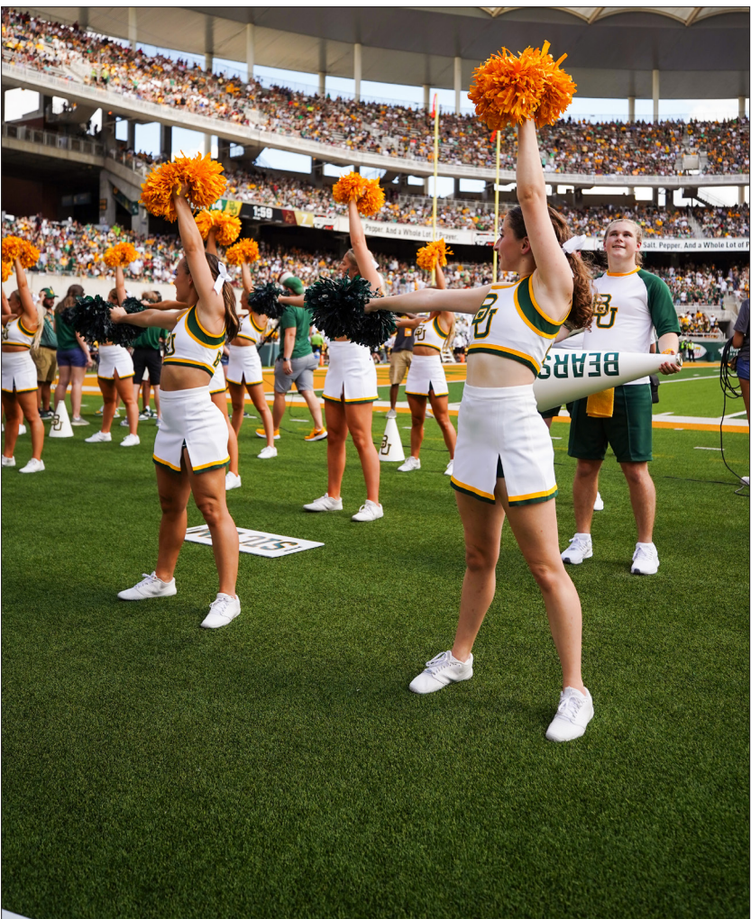
SIC 'EM The Baylor Spirt Squad amps up fans during the football team's home opener against the University at Albany on Sept. 3, 2022 at McLane Stadium.