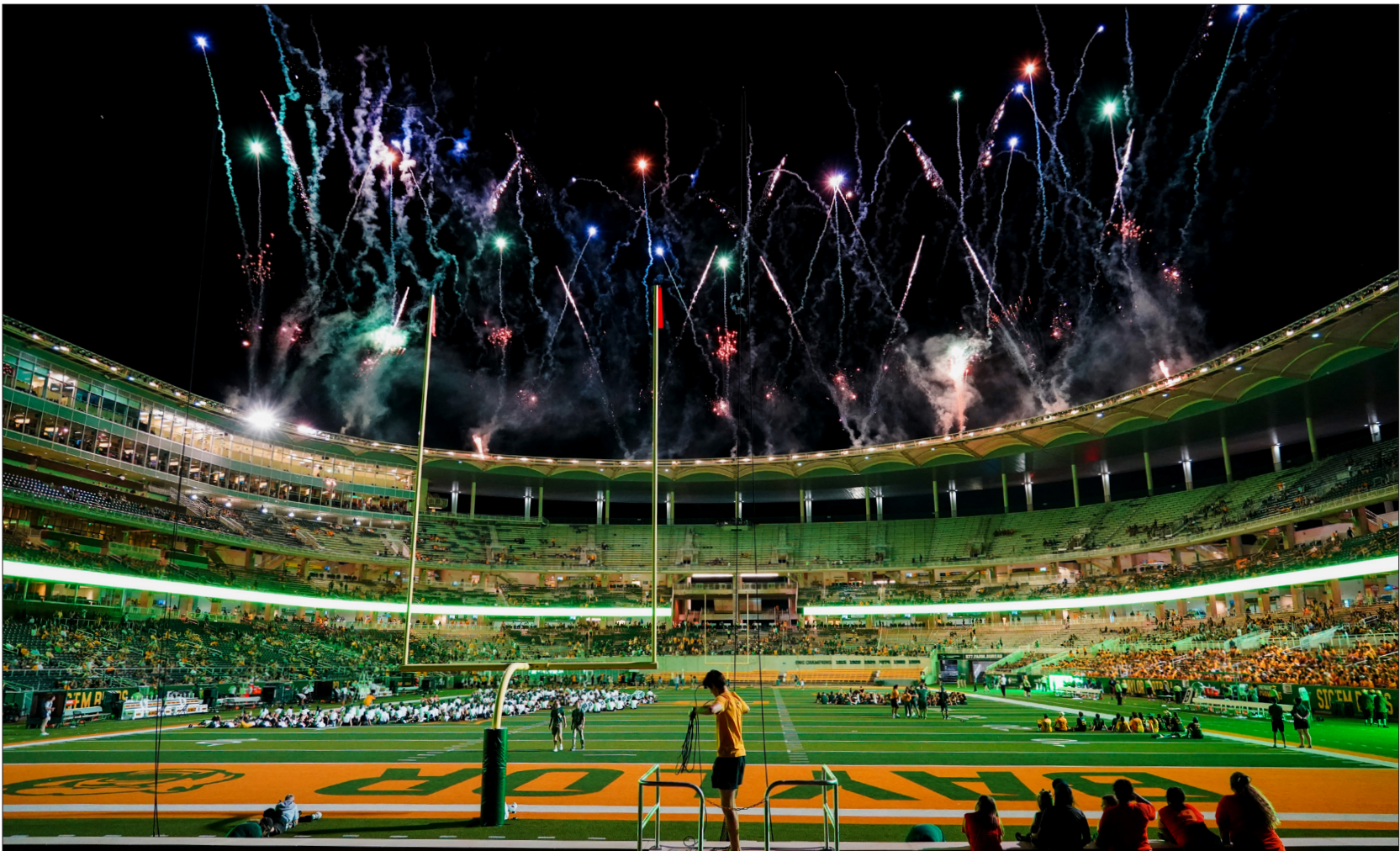
LIGHT THE NIGHT Fireworks shine in the sky at McLane Stadium following the football team's non-conference contest against the University at Albany on Sept. 3, 2022.

We heard your feedback, so here's The Baylor Lariat Sports Desk's responses and analysis as we prepare for the 2023 football season