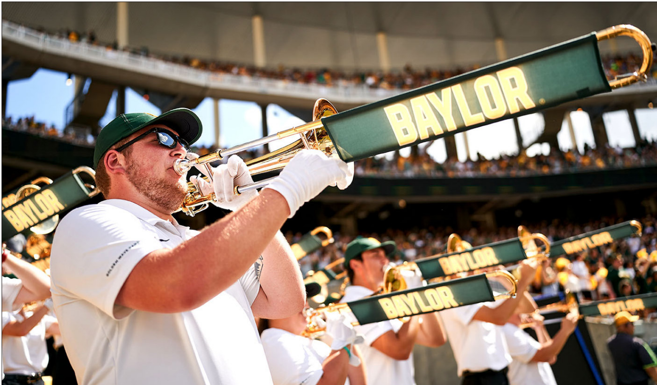
PUMP IT UP A member of the Golden Wave Band plays the trombone during a game against the University at Albany on Sept. 3, 2022 at McLane Stadium.