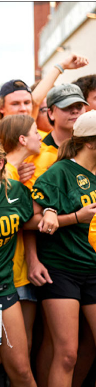
Sept. 3, 2022 at McLane Stadium.