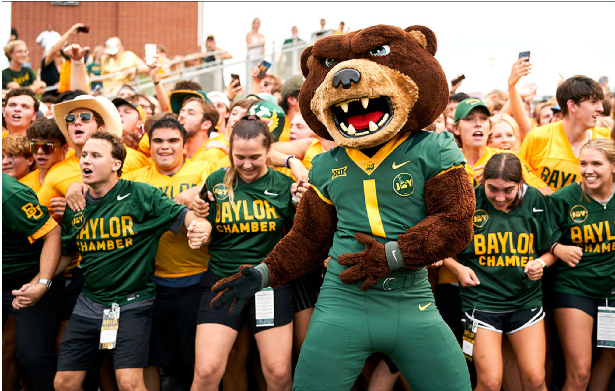
READY TO RUN Bruiser stands in front of the Baylor Chamber members as they hold off Baylor students that prepare to run the line before the football team’s home opener against the University of Albany on Sept. 3, 2022 at McLane Stadium.