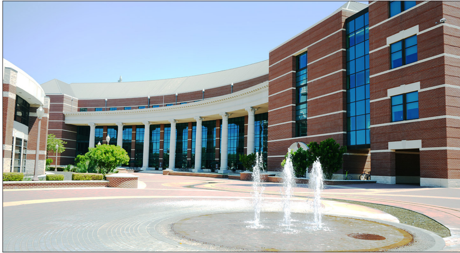
NEW DEGREES New degree programs in health science make their way to Baylor’s campus.