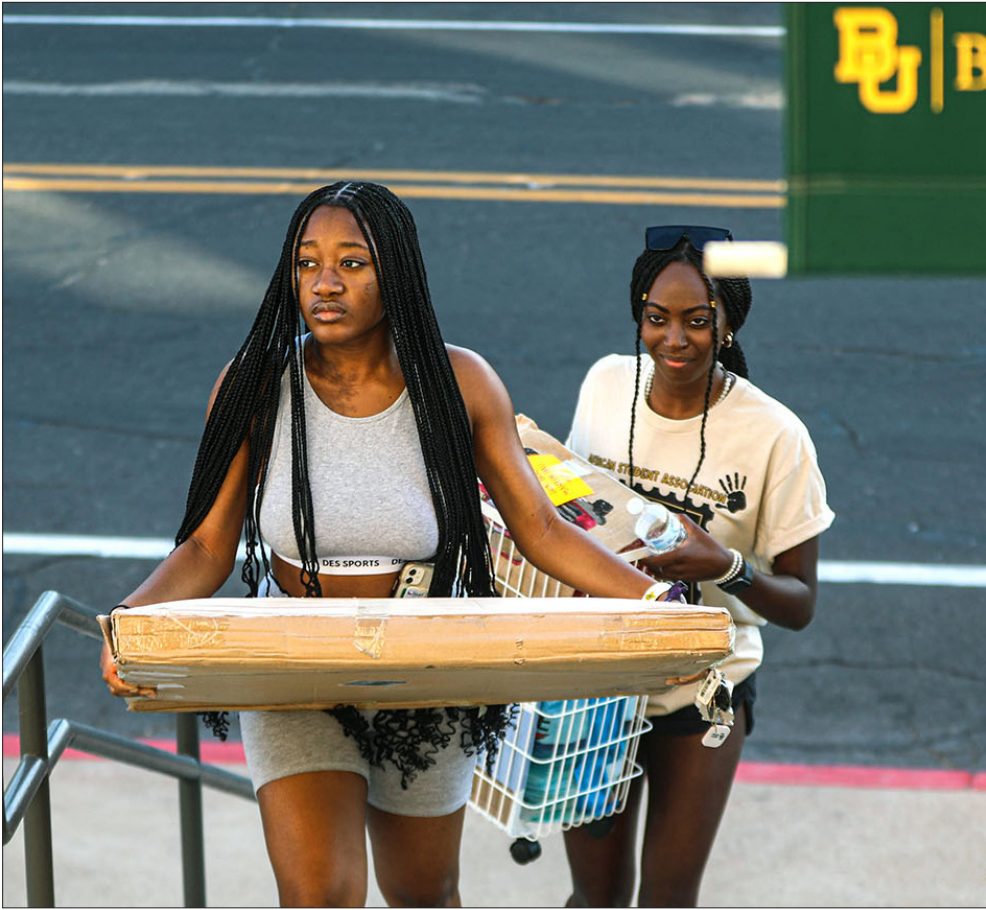
SETTLING IN Students storm Baylor residence halls with arms full of boxes, bags and other things.