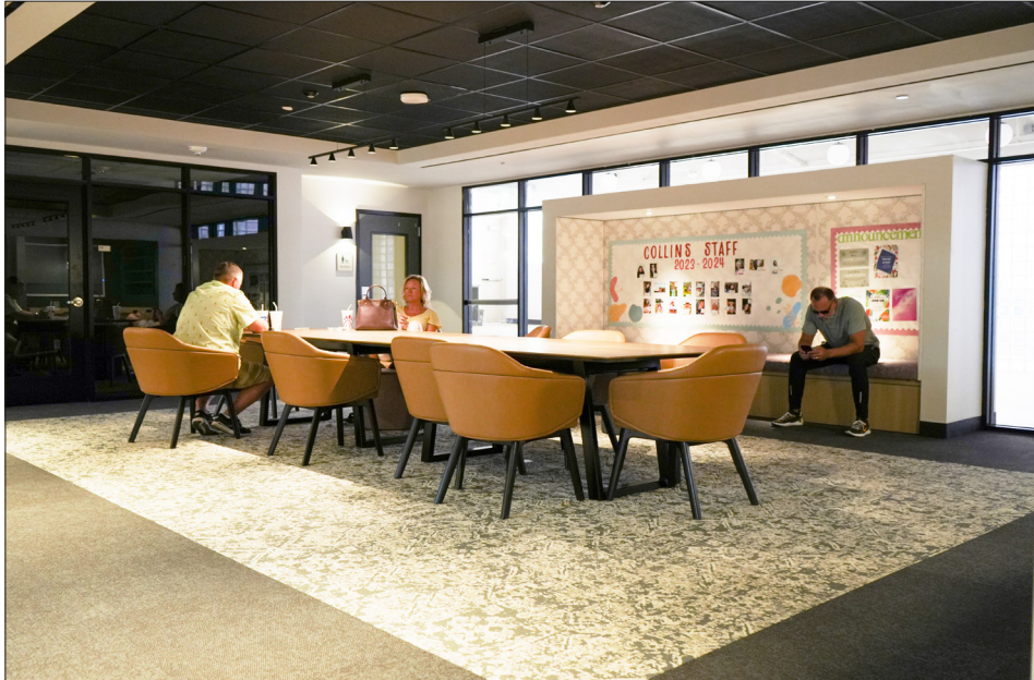
INSIDE THE HALLS Collins has updated rooms, as well as a staff room.