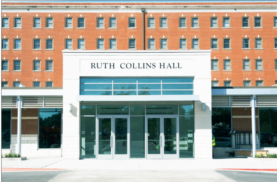
NEW FRONT DOOR Collins Hall introduces a new entrance facing campus.