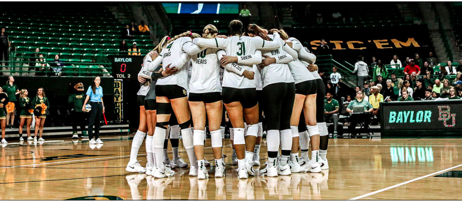
IN THE ZONE Baylor volleyball huddles before its 2022 NCAA Division I Volleyball Championship first round match against Stephen F. Austin State University on Dec. 1, 2022, in the Ferrell Center.