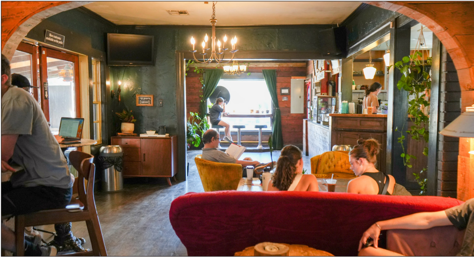
WALKING THE 254 Common Grounds on Eighth Street is a Baylor staple just off campus where students can hang out or study.