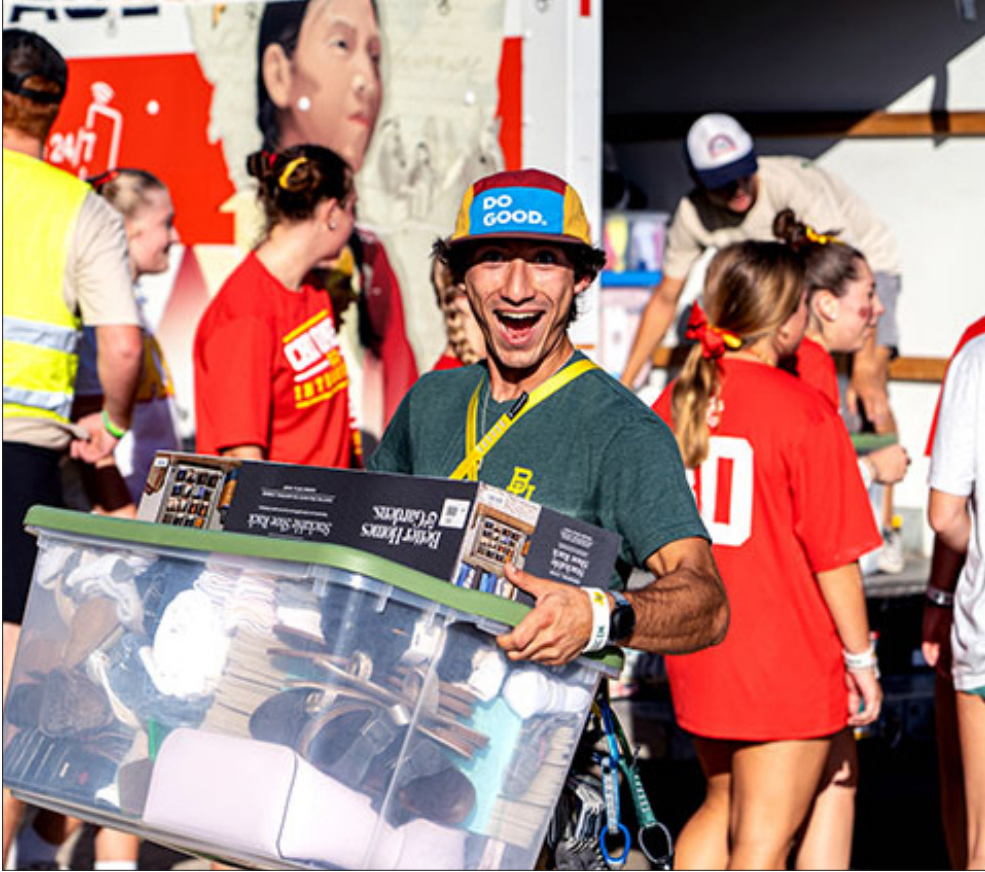
LEND A HAND Volunteers help over 3,000 freshmen move to campus and into residence halls.