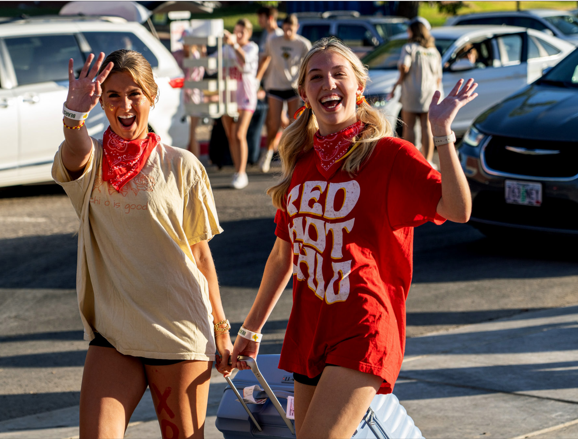
ations stepped out to lend a hand in Move2BU. Operating much like an airport, volunteers helping with move-in act as baggage handlers to transport new students' personal belongings to the residence halls.