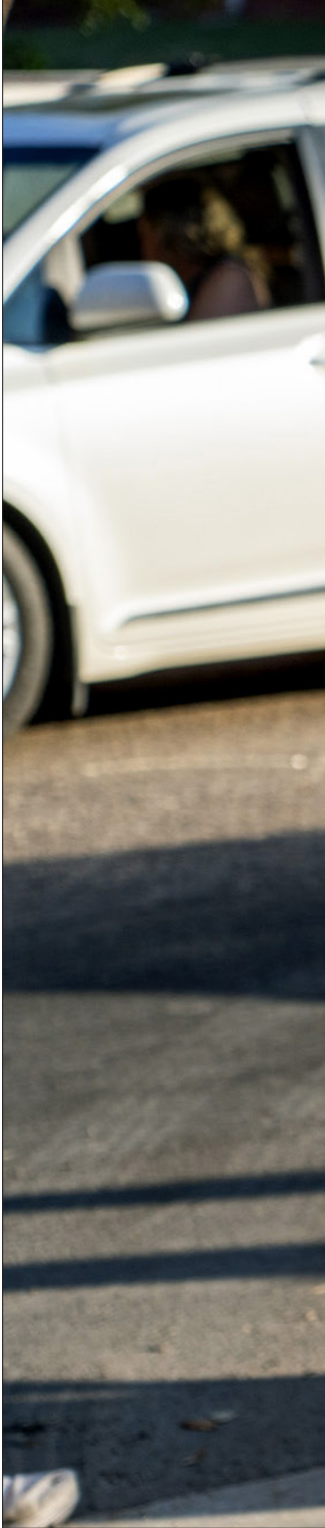
GOLDEN SMILES Greek organization members help with move-in.