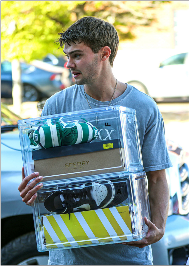
PRECIOUS CARGO The freshmen didn't forget their best kicks.