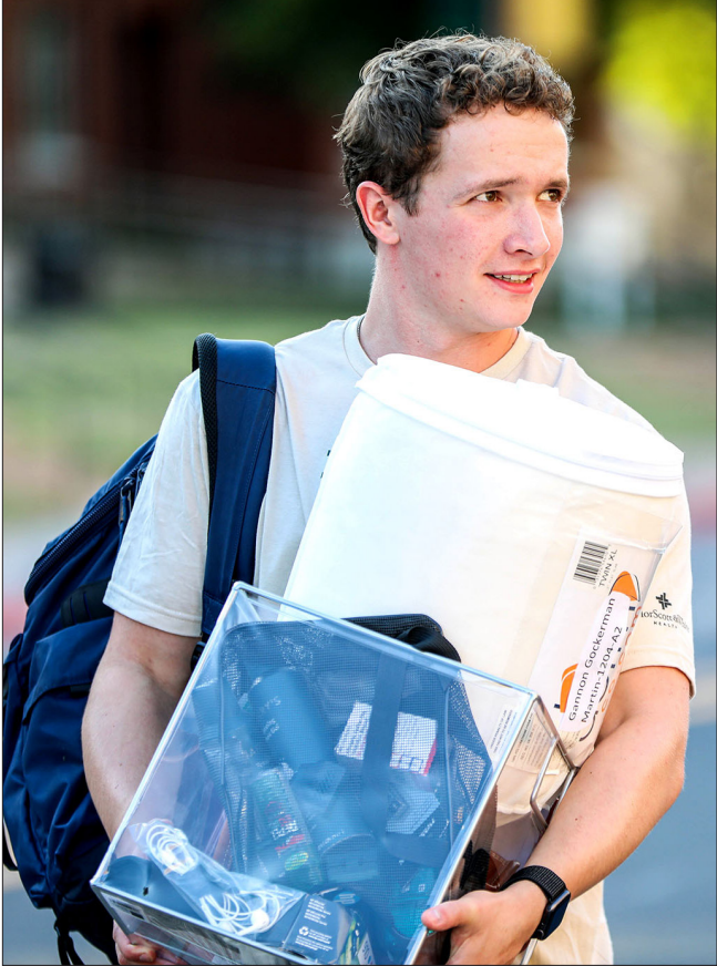
BEAT THE HEAT Students enjoy a warm welcome for move-in.