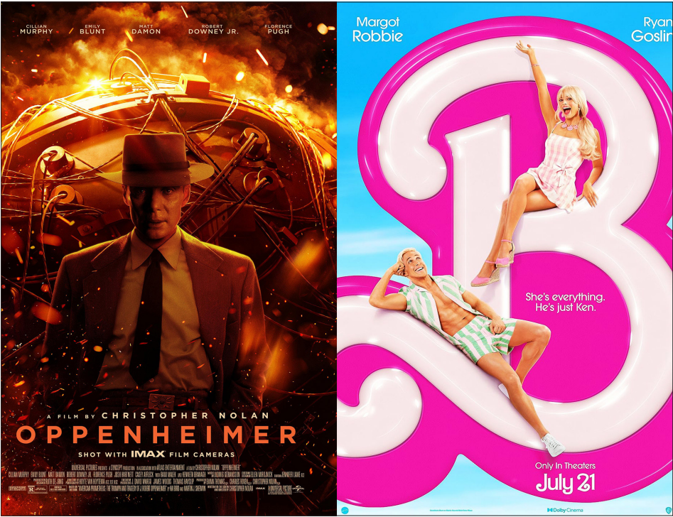
‘BARBENHEIMER’ SUMMER In their opening weekend, “Barbie” grossed $155 million in ticket sales, and “Oppenheimer” brought in $82.4 million.