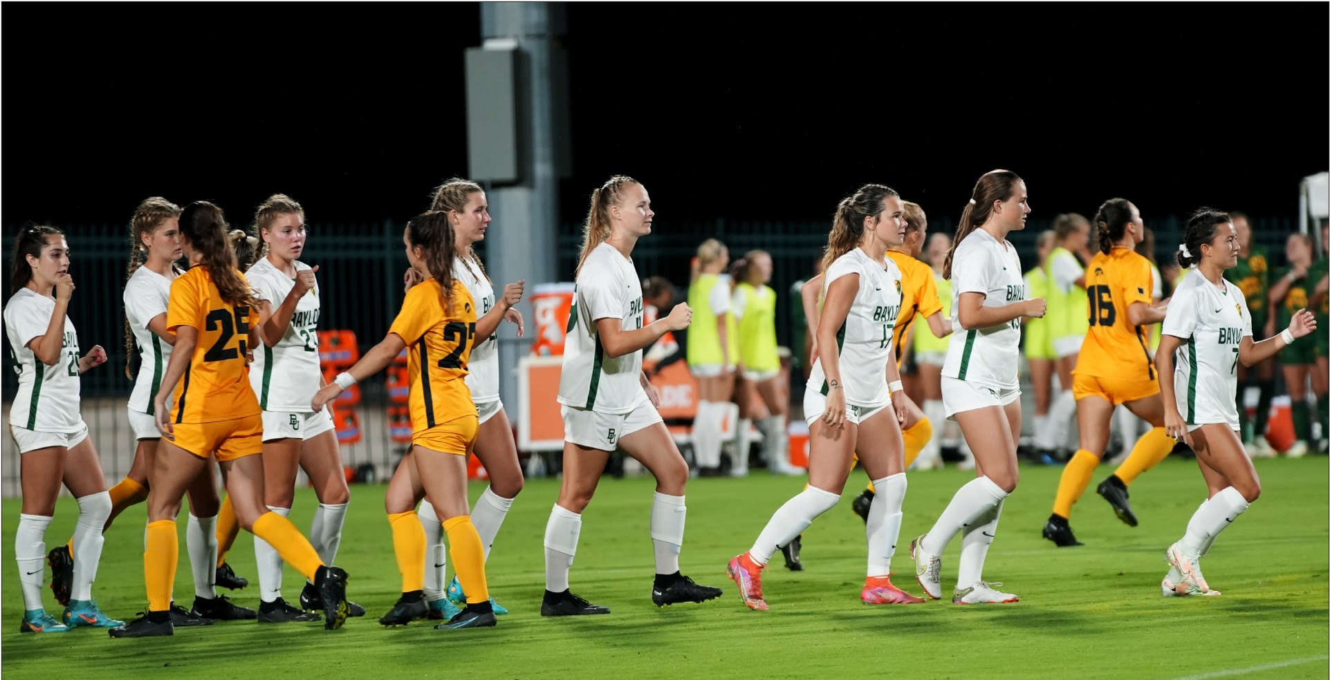
BEAR DOWN Baylor women’s soccer high-fives members of the University of Iowa following the national anthem and starting lineups during a home contest on Oct. 13, 2022, at Betty Lou Mays Field.