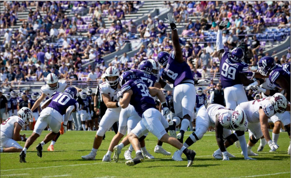
SCANDAL The Northwestern Wildcats defend kick during a regular season contest against Southern Illinois University on Sept. 17, 2022, in Evanston, Ill.