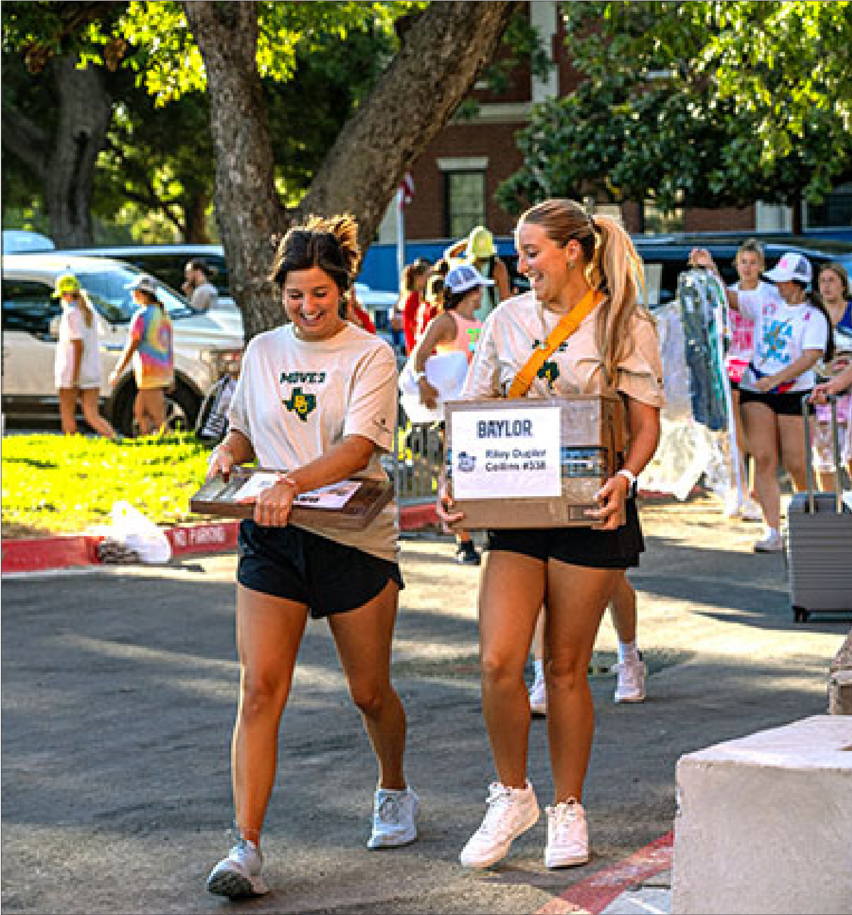
SEEING MOVE2BU THROUGH Volunteers including faculty, staff and students have it down to a science during the 21st year of fully coordinated move-in.