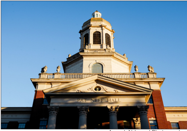
ICONIC SYMBOL Pat Neff Hall houses important campus offices and is one of BAYLOR's most historic features.