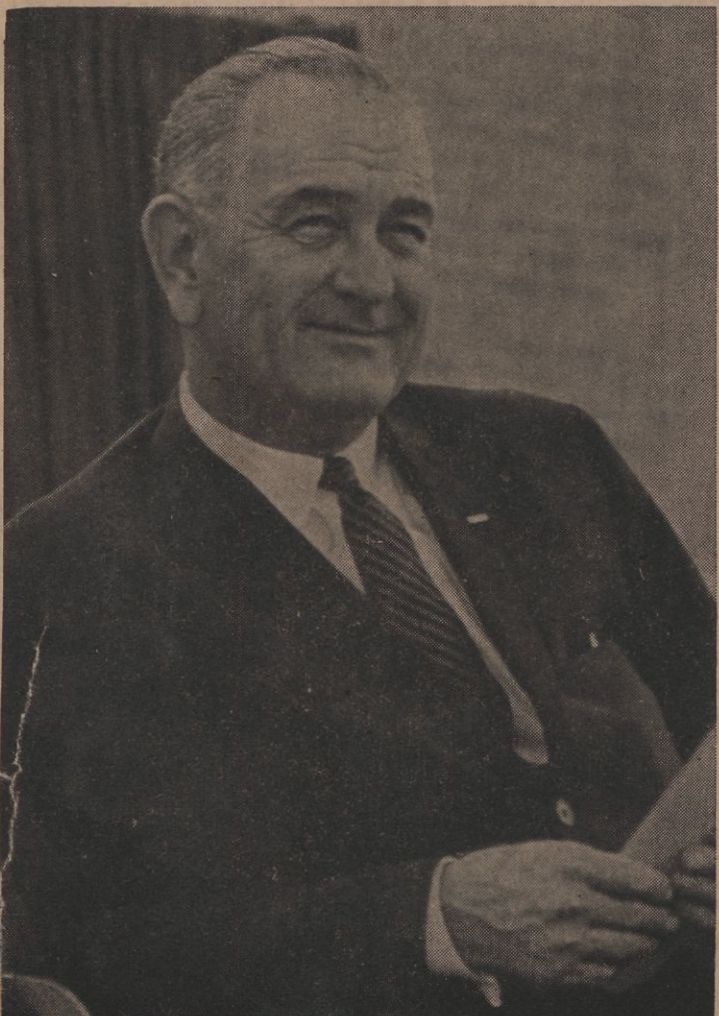
JOHNSON IN SAN ANTONIO THURSDAY The Vice-President Was Riding In Another Car Friday