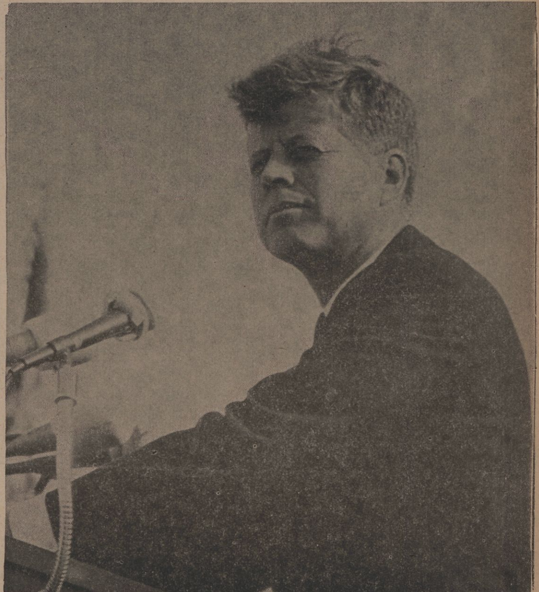
A FINAL PHOTOGRAPH—This photograph of President Kennedy was taken in San Antonio Thursday by Lariat photographer Paul Currier, less than 24 hours before the President was killed.

"All Baylor people will join in prayer for the family of President Kennedy and for our nation in this crisis."